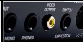
Composite video output.