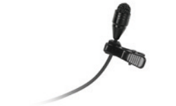
TG L58c Mini condenser lavalier microphone, with 4-pin mini-XLR connector, available in both black and tan.