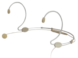
TG H56c Condenser neckworn microphone, with 4-pin mini-XLR connector, available in both black and tan.