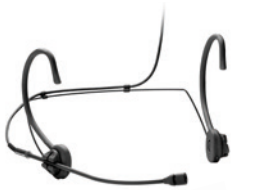
TG H74c Condenser neckworn microphone, with 4-pin mini-XLR connector, available in both black and tan.