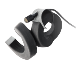
TG I58c Helix Condenser microphone for instruments, with helix clamp, with 4-pin mini-XLR connector, available in black.