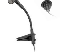
TG I57c Condenser clip-on microphone for wind instruments, with 4-pin mini-XLR connector, available in black.