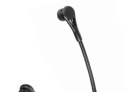
TG I56c Condenser microphone for accordions and styrian harmonicas, with 4-pin mini-XLR connector, available in black.