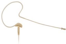
TG H57c Condenser earhook microphone, with 4-pin mini-XLR connector, available in tan.