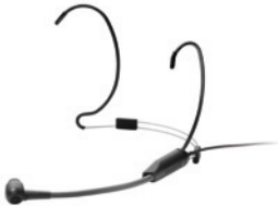
TG H54c Condenser neckworn microphone, with 4-pin mini-XLR connector, available in both black and tan.